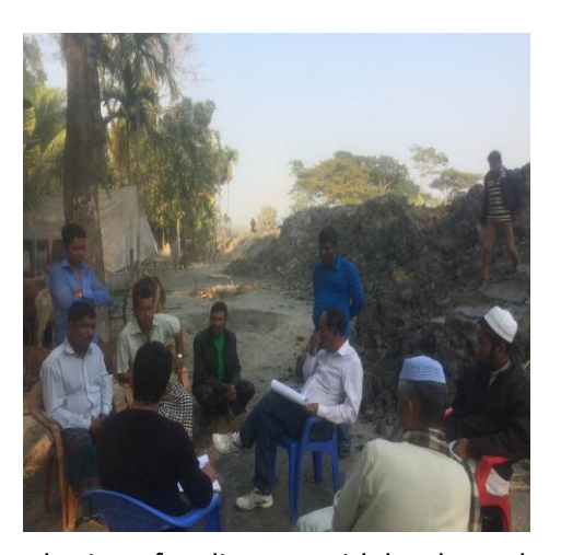
Consultation of audit team with local people