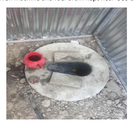
Latrine with no water seal in worksite