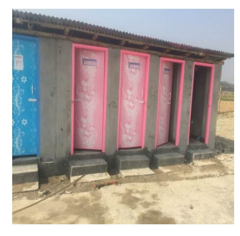
Latrine facility for local worker