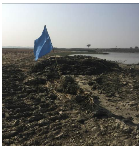
Preserving top soil with demarcation