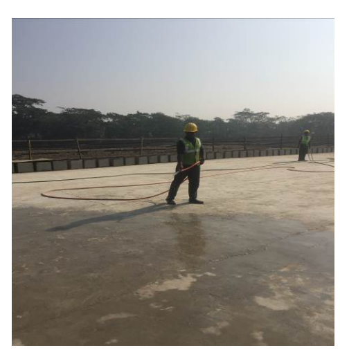
Worker sprinkling water in worksite to control dust