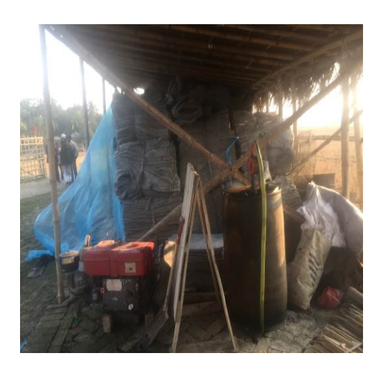
Fuel driven machine and fuel drum kept near Geo bags