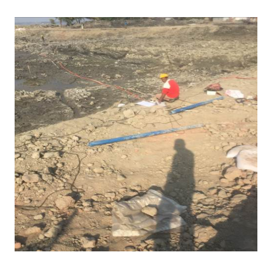
Electric wire on ground in worksite of DS