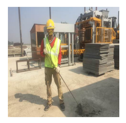
Worker using PPE