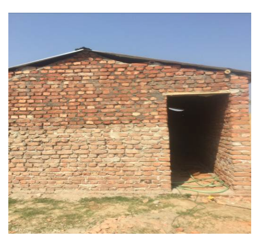
Electric equipment with no danger sign or door