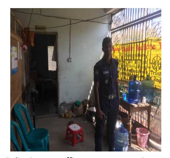
Police in camp office to ensure security