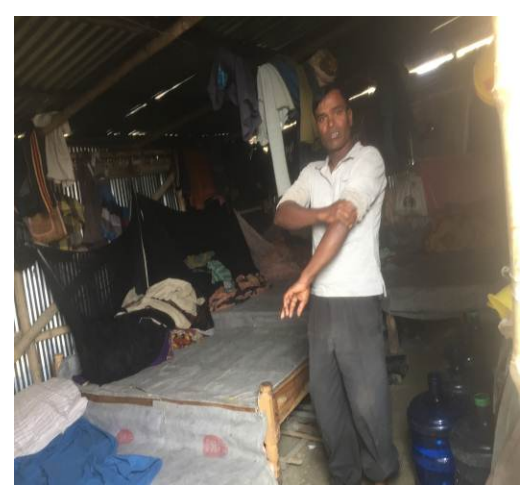
Inadequate living space in worksite for worker