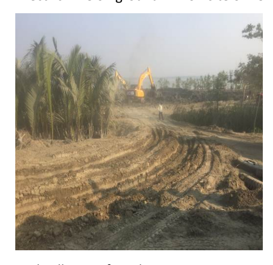
Soil collection from borrow pit, no demarcation fencing